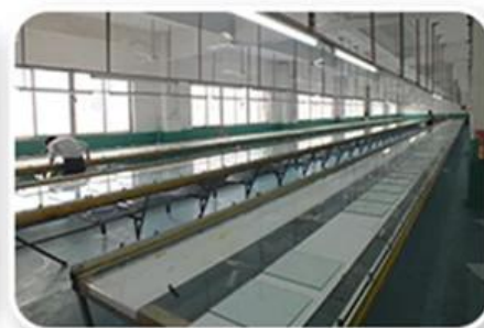
Screen Printing Workshop