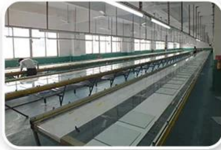
Screen Printing Workshop