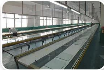
Screen Printing Workshop