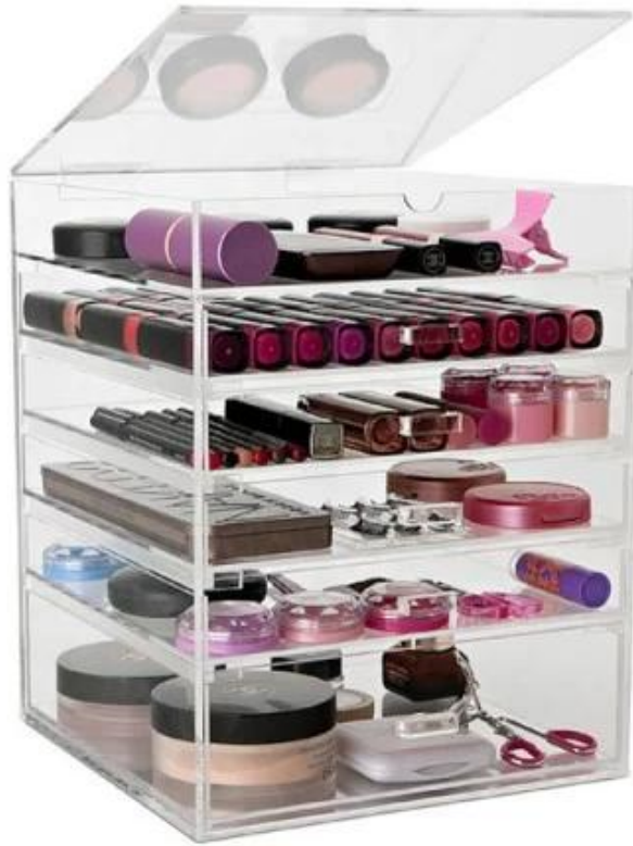
Customized Clear Acrylic Makeup Box Display With Drawer