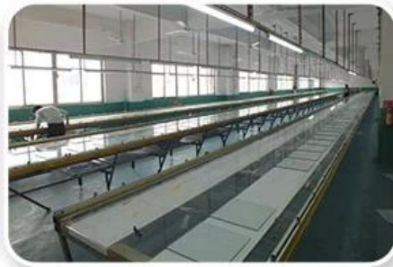
Screen Printing Workshop